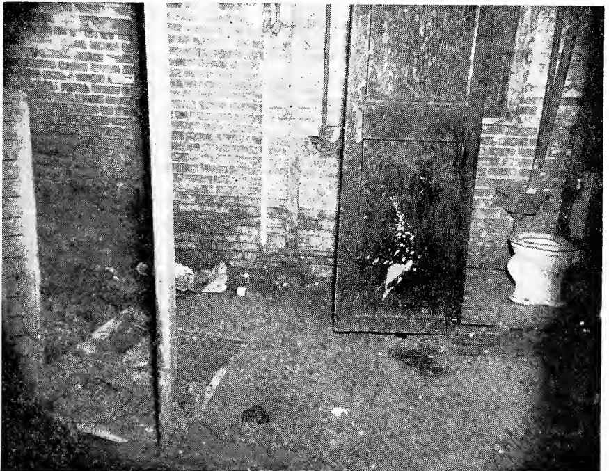
No bathroom but a toilet is near the coal bin.